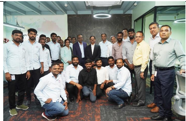
Group Photo of L&TMRHL and Trendz Workspace