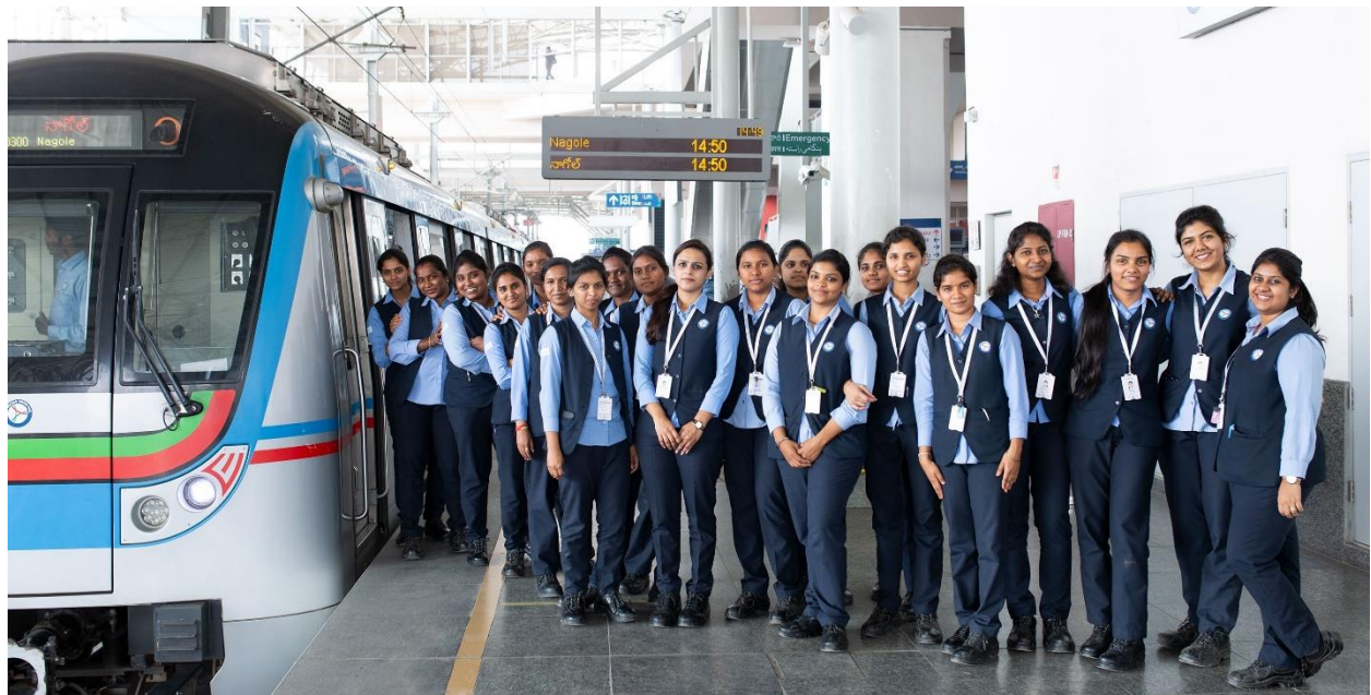
#EachforEqual – HMR – Women Train Operators celebrating International Women’s Day at Ameerpet Metro Station